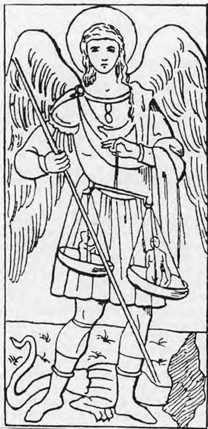
St Michael weighing the souls of the dead (15th century)