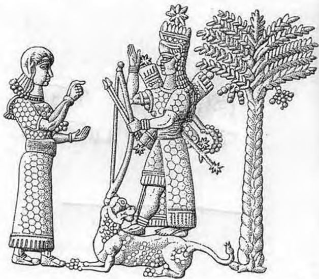
Ishtar and the Tree of Life

women, but also with the goddess Ishtar. She said she would only have sex with the angel if he revealed to her the secret name of God. When Shemyaza told her she used this knowledge to ascend to the stars and reign among the constellation of the Pleiades. While the other Watchers were punished by God, Shemyaza alone repented his error and sentenced himself to be hung upside down for eternity in the constellation of Orion the Hunter. It is interesting that the oldest known image of a star pattern ever found is that of Orion. It is on a tiny tablet of mammoth ivory dated to 35,000 years ago and depicts a man standing in a pentagram or five-pointed star position. He has a sword or club hanging from his