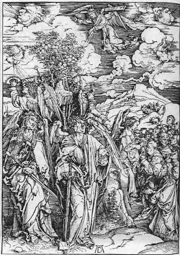
The four archangels as the four winds