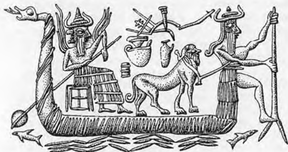
The solar boat of Shamesh