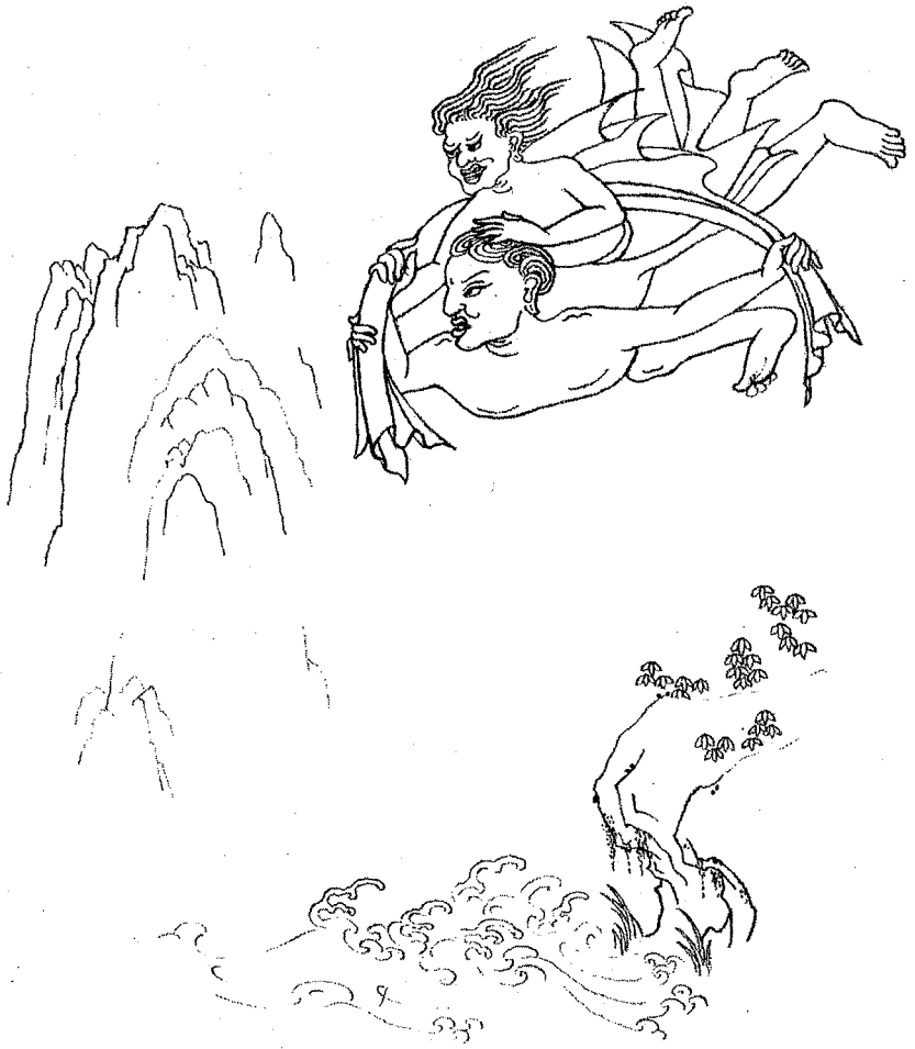
Kantalipa (Tsembupa) attained vajra -fearlessness.