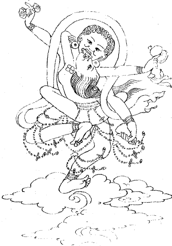
Ghaṇṭāpa is favored by his vajra -queen.