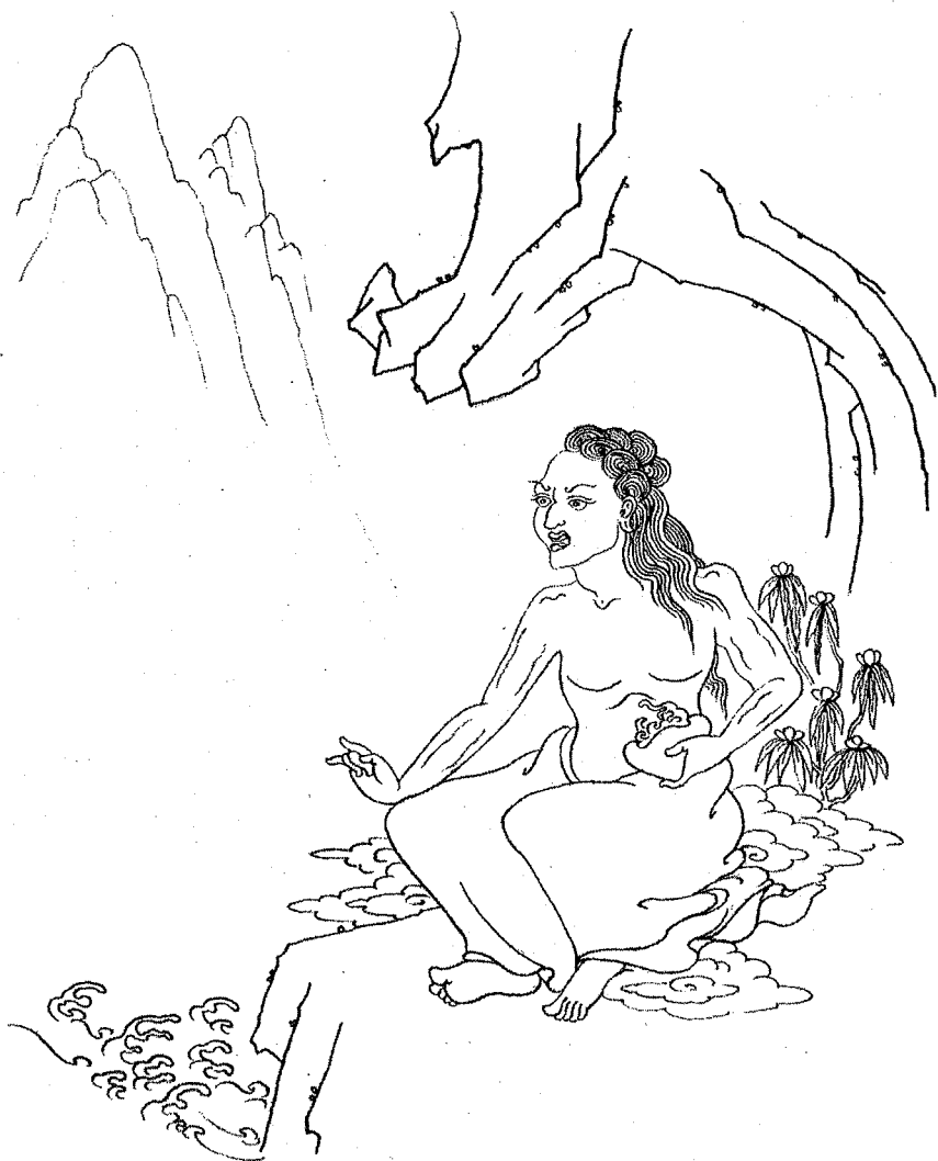
Kāṇhapa (Kṛṣṇācārya) subdues the elemental spirits.