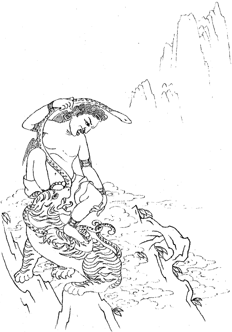
Ḍombi Heruka moves at will on the back of a tiger.