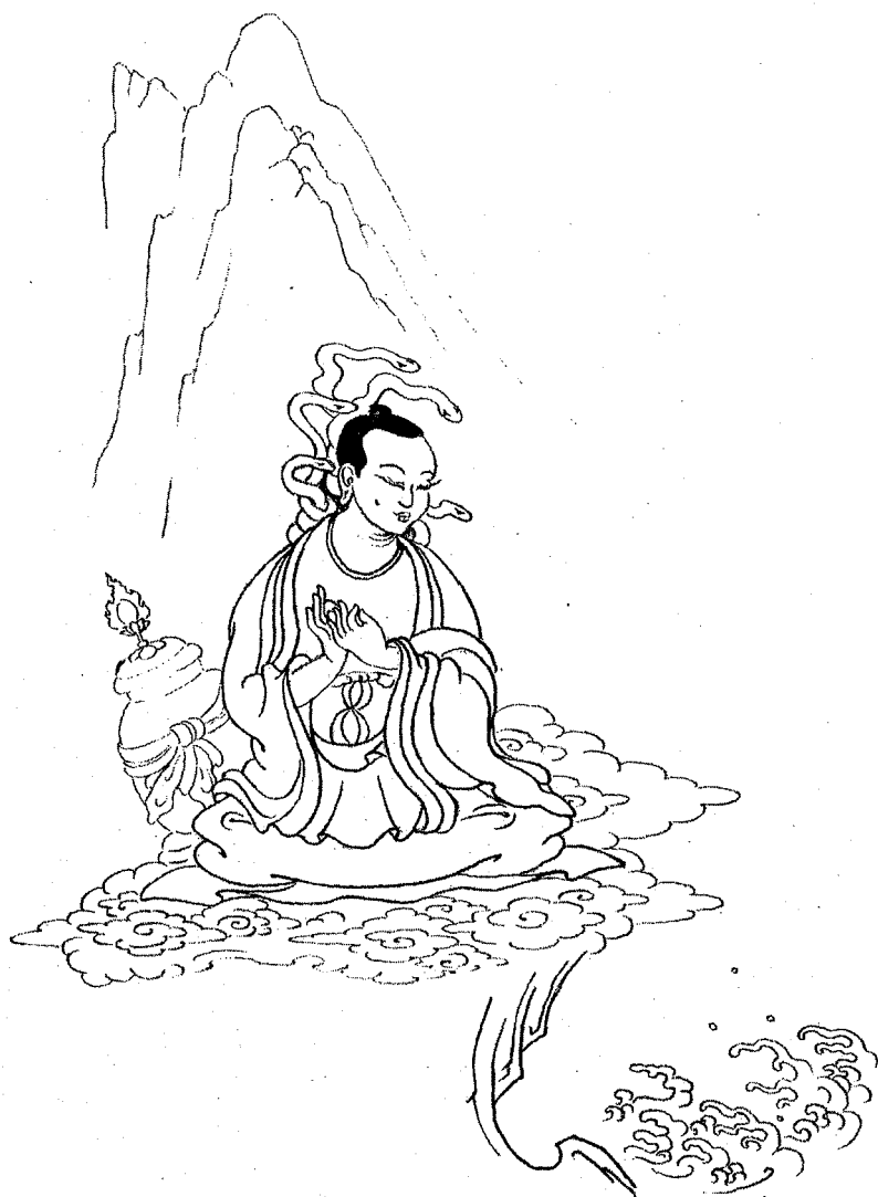
Ārya Nāgārjuna, the Second Buddha.