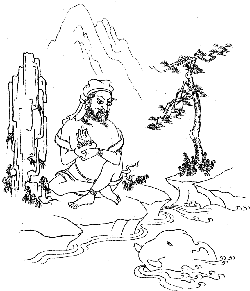
Nāgabodhi abides on the Sacred Mountain Śrī Parvata.