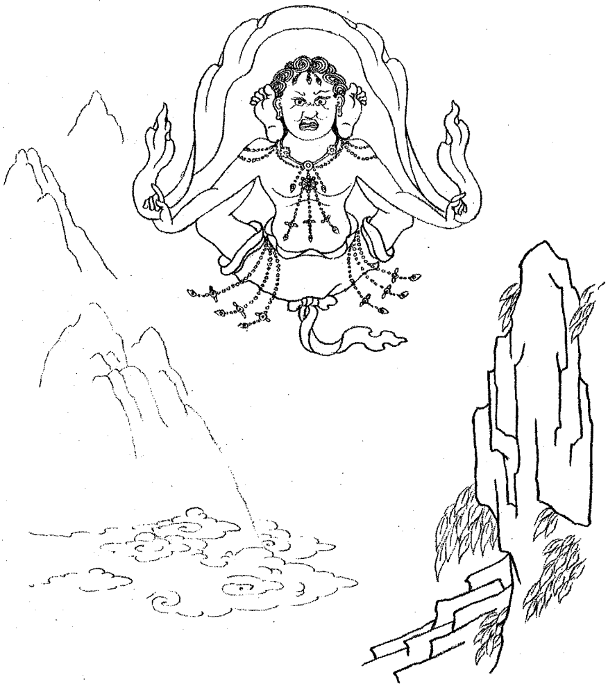
Udhilipa (Dingipa) unites with all-pervasive space.