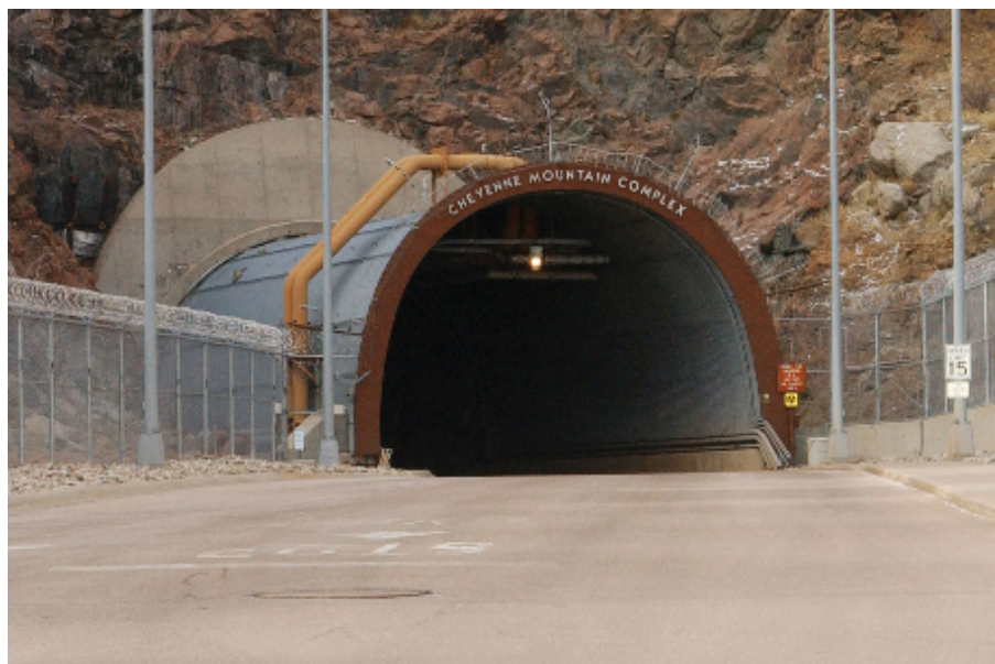
North portal, Cheyenne Mountain

"Not only is our government focused on building deep secret cities, but so are Illuminati families."