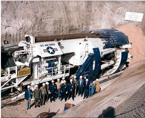
(left, tunneling machine)

During the 1990's, my research repeatedly brought me in contact with individuals who stated that they had been in deep underground military bases.