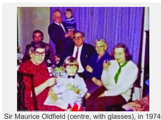
Sir Maurice Oldfield (centre, with glasses), in 1974.