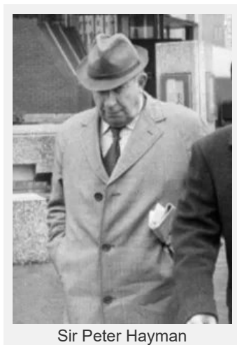
Sir Peter Hayman