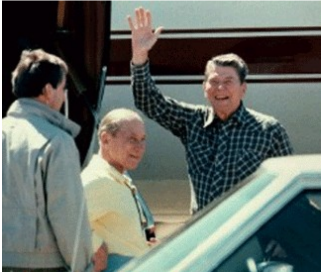
July 29, 1989: Ronald Reagan with traveling companion retired U.S. Marine Lt. General Victor Krulak (in the yellow shirt)