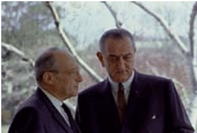
President Johnson with Walt Whitman Rostow