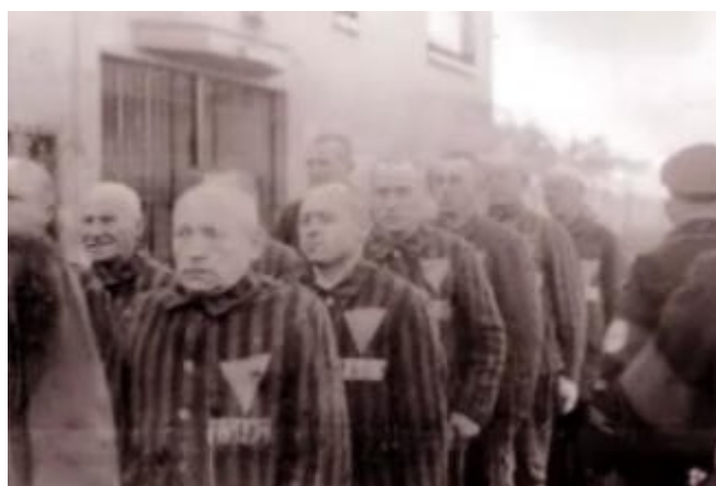
The Pink Triangle Boys