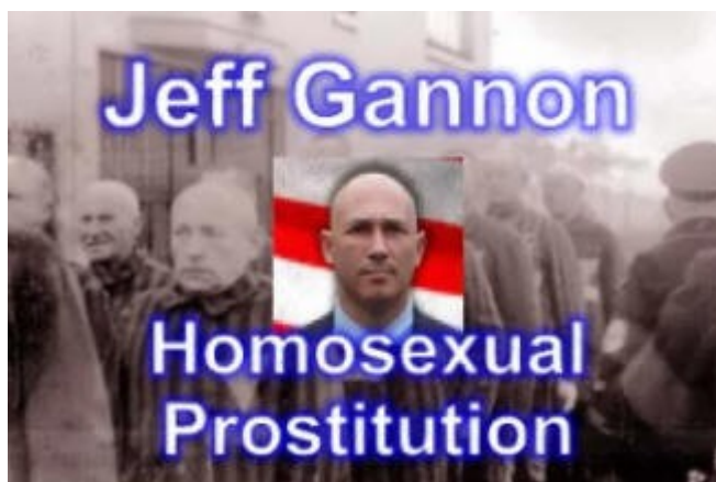
Jeff Gannon, Homosexual Prostitution