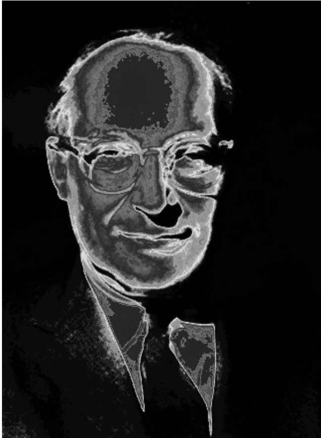
Walt Whitman Rostow