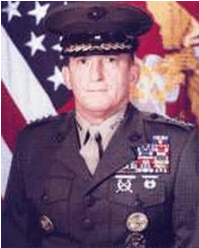
General Charles C. Krulak, Commandant of the Marine Corps