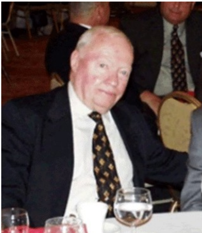
General Al Gray (left), former Commandant U.S. Marine Corps